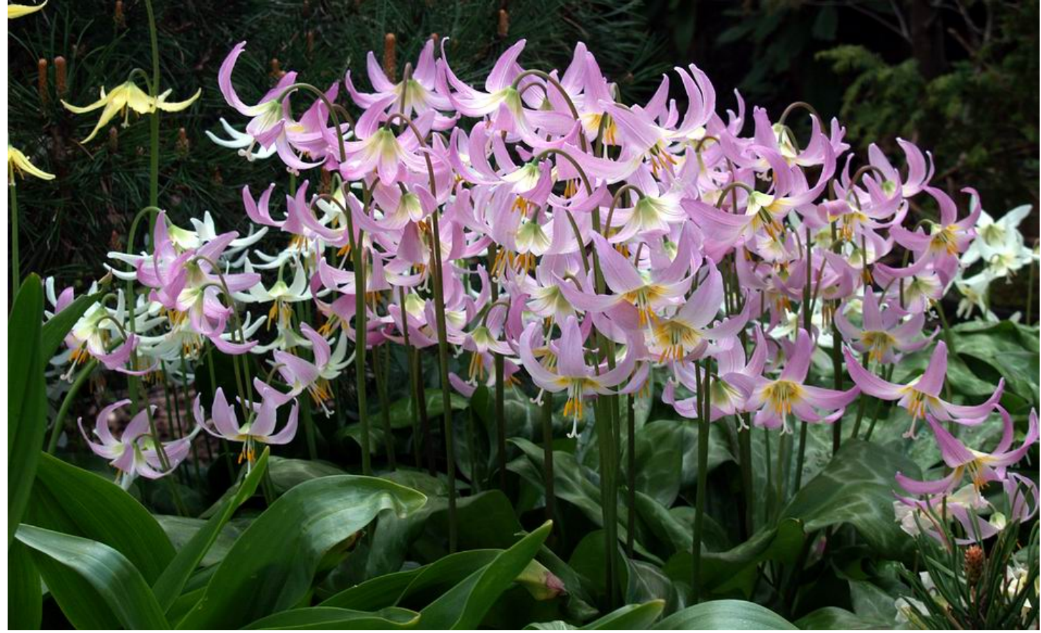
Erythronium 'Craigton Cover Girl'

While I am unsure if the flower above is a hybrid I am sure that this one is a hybrid – the shape of the filaments gives that away. It is a good strong colour with a dramatic yellow centre that has a red zig zag and I am watching it with anticipation and hope that it will be a good increaser.