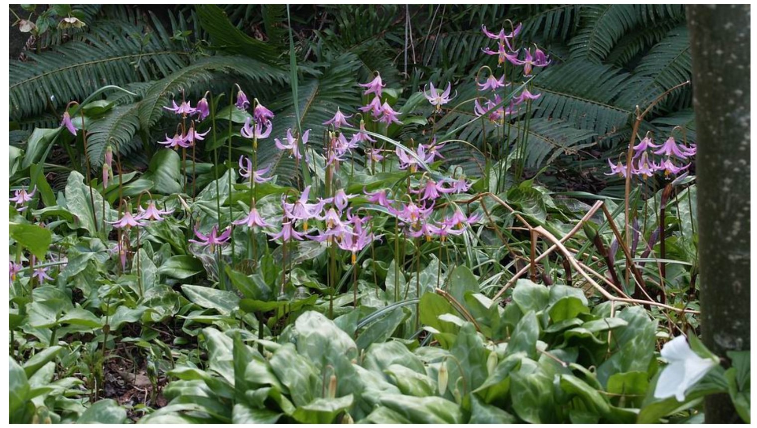
Erythronium revolutum in garden bed

I will finish off this week with two more pictures of Erythroniums growing in our garden – above is a bed where I am leaving the Erythroniums to naturalise by self seeding and below a happy community of bulbs that certainly brighten our life every time we walk around the garden in the spring time.