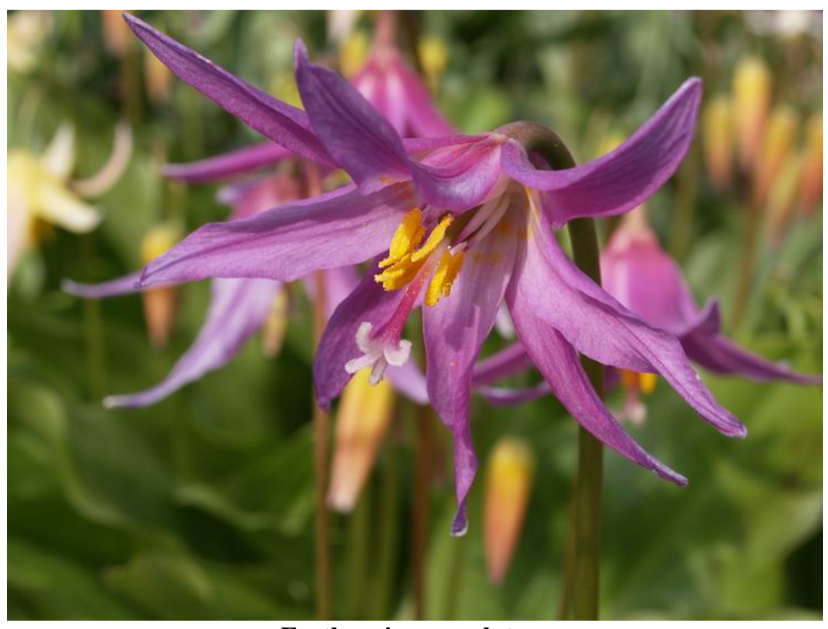
Erythronium revolutum This is a very dark form with a lot of dark pink on two thirds of the style.