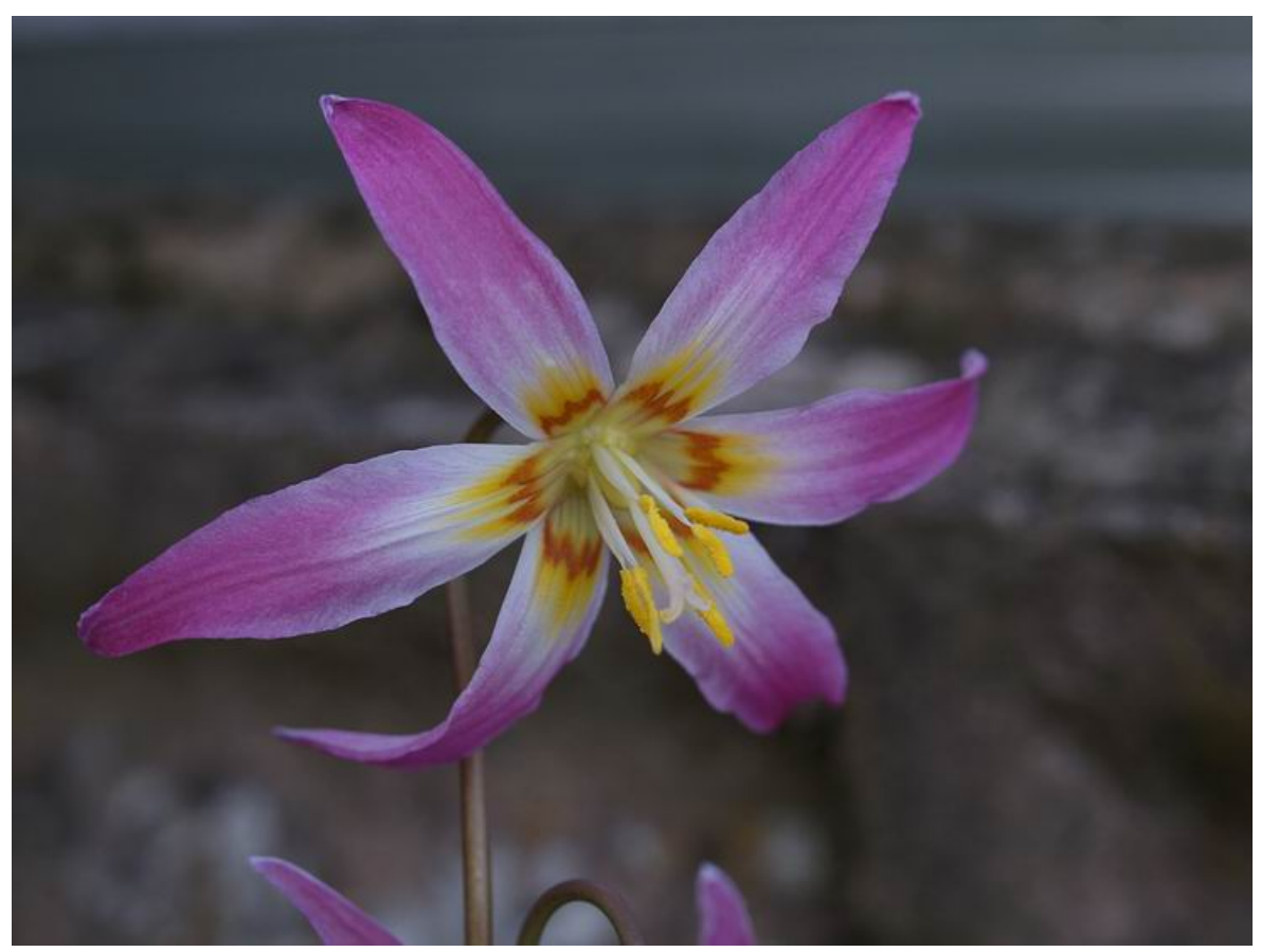
Erythronium revolutum hybrid

While I am unsure if the flower above is a hybrid I am sure that this one is a hybrid – the shape of the filaments gives that away. It is a good strong colour with a dramatic yellow centre that has a red zig zag and I am watching it with anticipation and hope that it will be a good increaser.