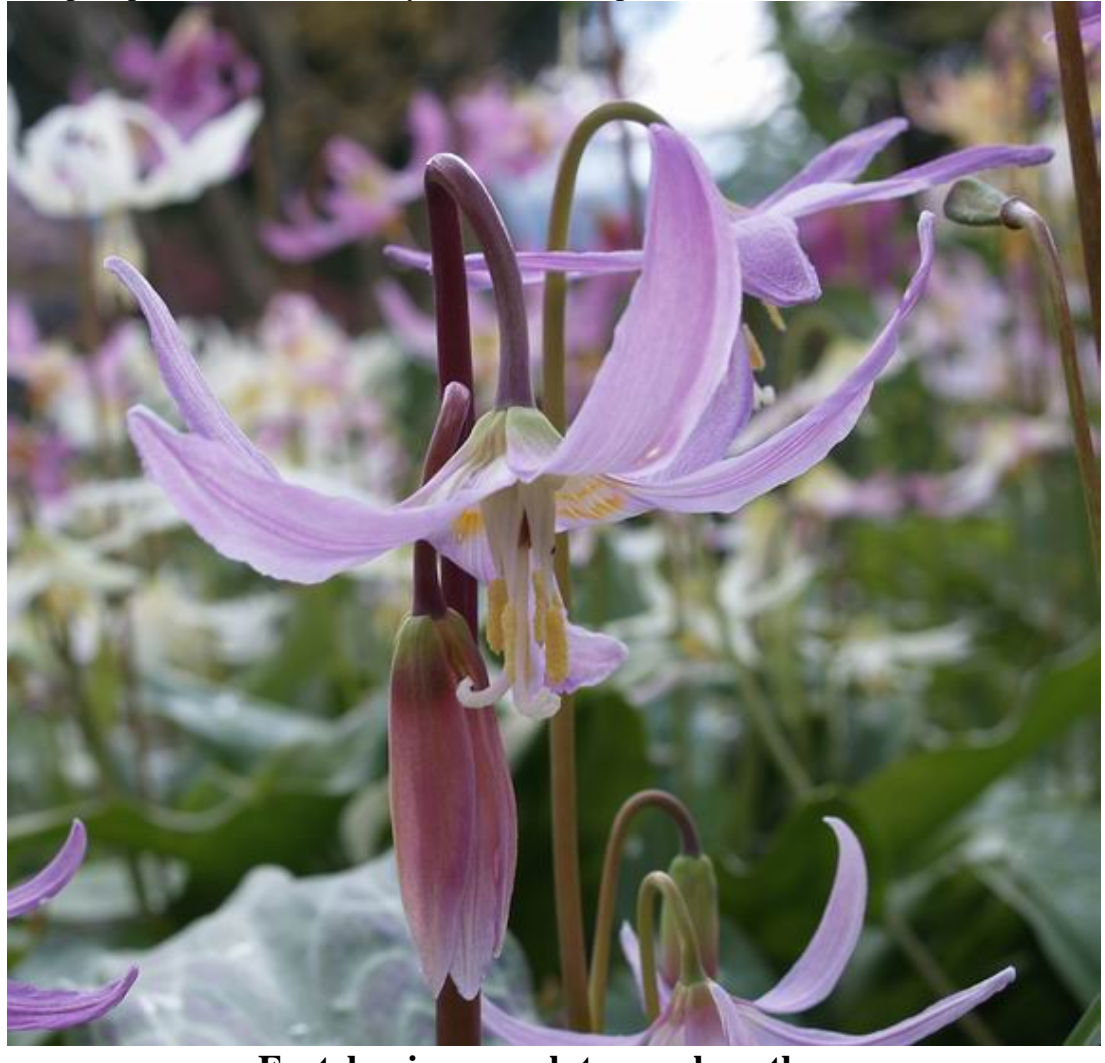
Erytrhonium revolutum pale anthers

Some have pale pink flowers and many have traces of pink in at the ends of the filaments and style.