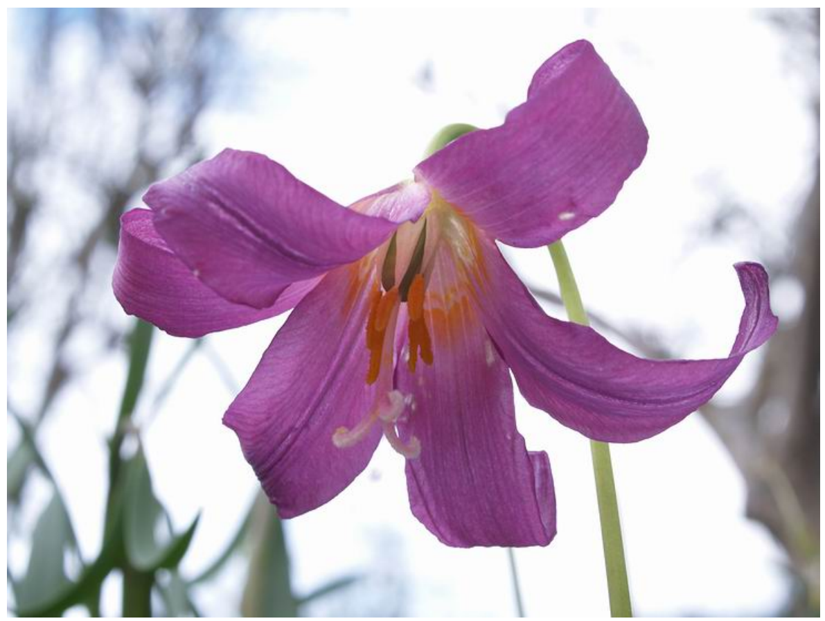
Erythronium revolutum wide petals

This form is also quite dark but I show it because of it's wider than normal overlapping petals.