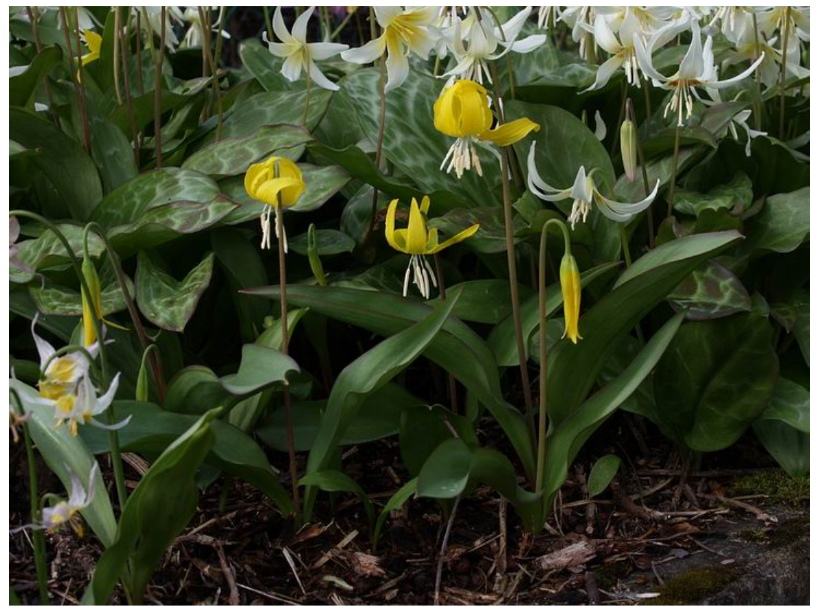
Erythronium grandiflorum pallidum

The Erythronium grandiflorum variety with the pale creamy-white anthers is called var. pallidum and it always comes into flower a few weeks later than the other two varieties in our garden - I discussed them in bulb log 16. This species has plain green leaves but again the pallidum variety we grow differs from the other two in that it has a purple line running around the leaf edge. I would be interested to learn if this feature is constant in var. pallidum or if it is just in the stock that we have which I have raised by seed over a number of generations.