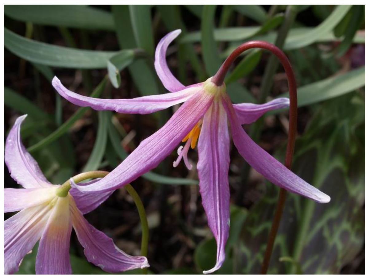
Erythronium revolutum narrow petals