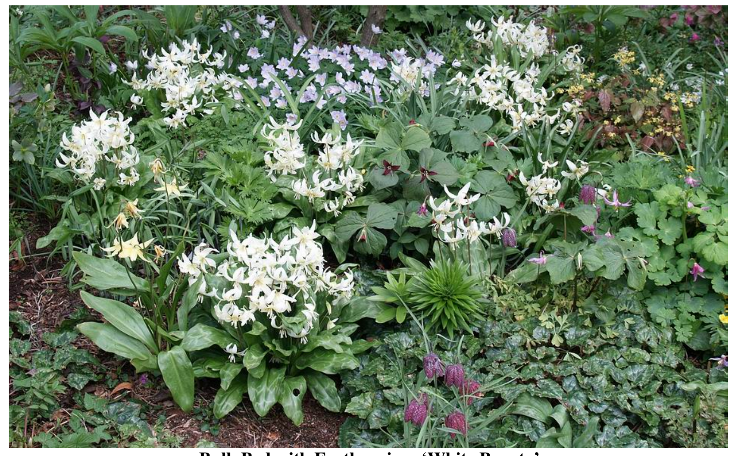
Bulb Bed with Erythronium 'White Beauty'

I find that most of the Erythronium, Trillium and other bulbs that prefer woodland conditions do best when planted en-masse like this. In Scotland there is not the need to provide shade from the sun – in fact I always say that as far as that is concerned Scotland is in shade. By this I mean that even in full sun the leaves will not be burnt as the sun does not have that power at this time of year this far north. However they do need protection and shelter from the cold and often very strong winds that we get and that is where the shrubs and trees come in; they filter and reduce the strength of the wind while the mass planting affords all the plants a further degree of protection from the destructive power of the wind.