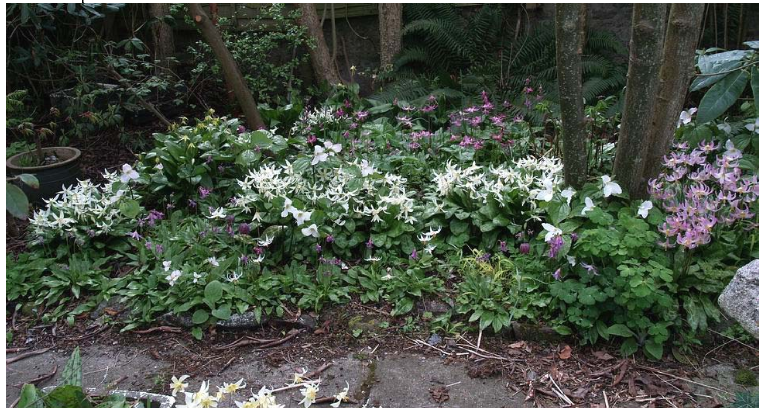
Bulb Bed with Erythronium and Trillium

I find that most of the Erythronium, Trillium and other bulbs that prefer woodland conditions do best when planted en-masse like this. In Scotland there is not the need to provide shade from the sun – in fact I always say that as far as that is concerned Scotland is in shade. By this I mean that even in full sun the leaves will not be burnt as the sun does not have that power at this time of year this far north. However they do need protection and shelter from the cold and often very strong winds that we get and that is where the shrubs and trees come in; they filter and reduce the strength of the wind while the mass planting affords all the plants a further degree of protection from the destructive power of the wind.