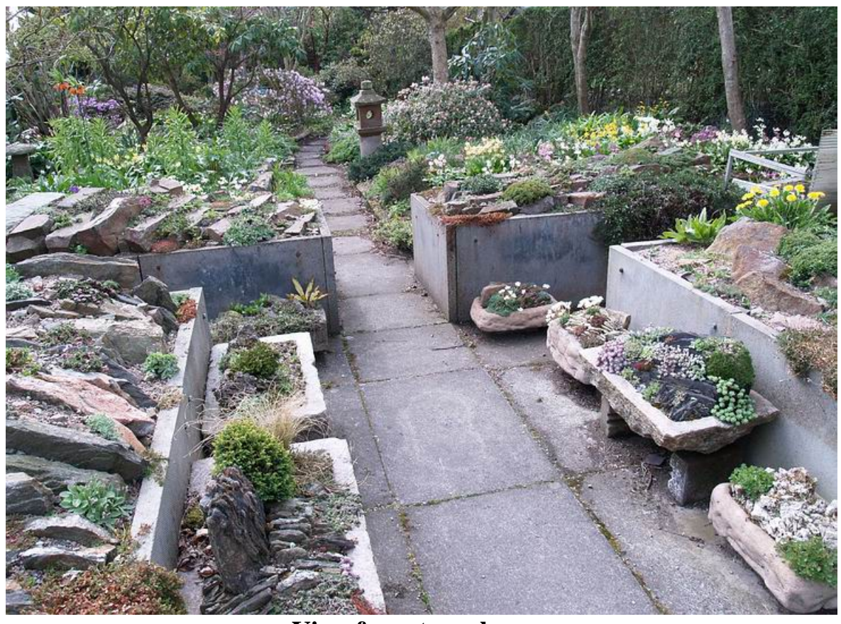
View from trough area

Many of the plants in the wider garden are only now waking from their winter rest but as regular readers of the Bulb Log know we have been enjoying the colourful mass displays of the early flowering bulbs for months. Now it is the time for the Erythroniums to take centre stage as they come to the peak of their flowering here in Aberdeen.