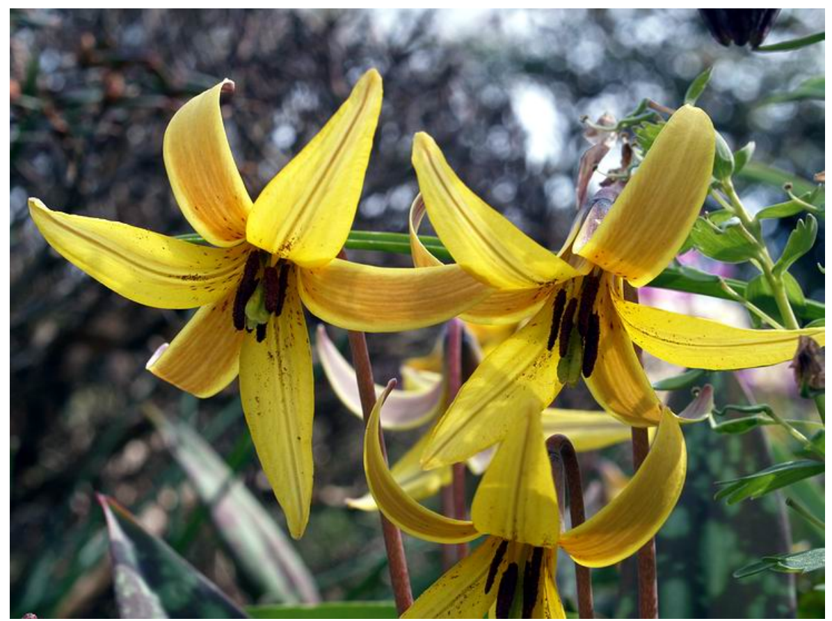
Erythronium americanum 'Craigton Flower'

I have no problems of poor flowering with the selection of Erythronium americanum that I named 'Craigton Flower'. As the name suggests it flowers every year and the clump increases steadily by decent sizes offsets.